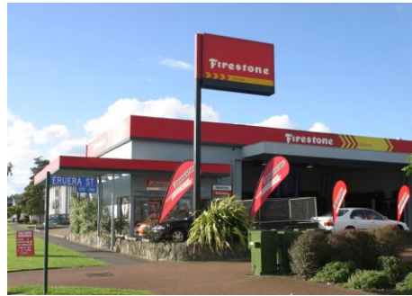
Original colour scheme 1997