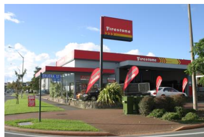
1997 – Firestone Direct

Next year we celebrate 25 years in business. Over that time we've met some wonderful people who come back to us year after year. We'd like to thank everyone for their loyalty and friendship. Also to our new customers this year – welcome to the S.I.M.M.O. family!